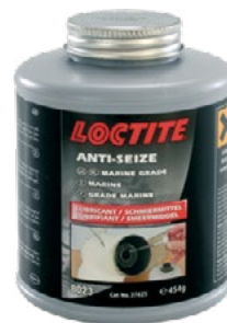
LOCTITE® Marine Grade Anti-Seize