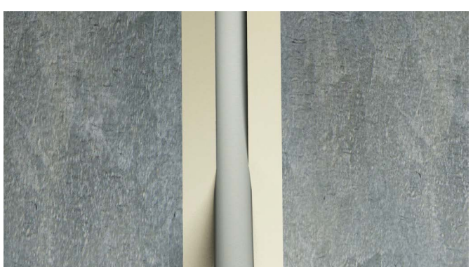
For illustration purpose only

A bond breaking backing rod (Polyrod)* shall be inserted into all movement joints to avoid a three sided adhesion. Use of a backing rod will ensure proper joint depth and at the same time facilitating the formation of an hour glass profile on the applied sealant. The backer rod will also provide resistance to sealant tooling pressure and help to attain proper wetting of the substrate when the sealant is being tooled. The diameter of the backing rod shall be at least 20% larger but not greater than 33% of the joint width. This will ensure that the backer rod remains in compression and in place during sealant installation. For static and joints where the depth is not sufficient for the use