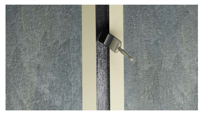
For illustration purpose only

Primer shall be applied to a clean and dry surface prior to the installation of backer rod or bond breaking tape. Polyprime PS* is recommended to be applied on porous substrates. For non-porous substrates such as steel or glass Polyprime NP* is recommended for optimum adhesion. The primer shall be applied by a brush in a thin coat application and shall be allowed to become tack free prior to the application of the sealant. The joint edges shall be