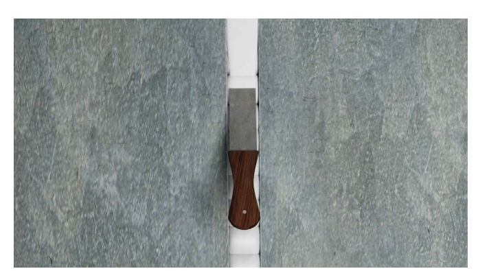
For illustration purpose only