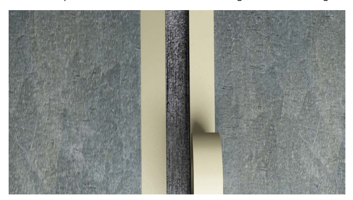
For illustration purpose only

The joint edges must be clean, dry and free from oil, loose particles, cement laitance and other contaminants which may affect the adhesion. A thorough wire brushing,