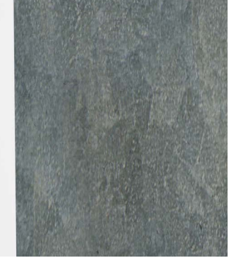
For illustration purpose only