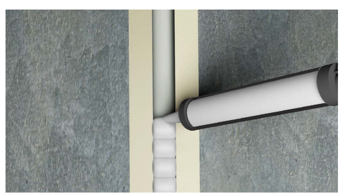
For illustration purpose only

DO NOT PART MIX. Since the base and the curing agent ratio controls the ultimate physical properties like adhesion, durability and strength, one complete kit has to be mixed at a time. The side and base of the container shall be periodically scrapped with a scrapper to ensure that the curing agent is properly dispersed and blended into the mix. Load the sealant immediately into the barrel gun by a heavy duty follower plate. Remove the cap and nozzle from the gun and ensure that the plunger is pushed all the way forward. The follower plate shall be placed on the flat surface on top of the pail. Place the barrel gun over the lip of the follower plate and depress the release plate and draw the material into the barrel by pulling back the plunger slowly. Fix the nozzle and start extruding into the joint firmly by maintaining an even pressure on the trigger of the gun. On vertical joints, sealant extrusion shall start from the bottom of the joint and continued to the top. For deep vertical joints, the sealant shall be filled in 2 to 3