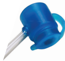
LOCTITE® 3922™ bonds thermoplastic inlet valve assembly.

Benefits of this light source are that it is inexpensive, small in size, portable, and generates minimal heat and minimal ultraviolet energy, making it safer to work with than traditional UV light sources.