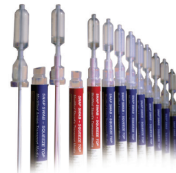
LOCTITE® 3311™ offers adhesion to various swab substrates, resulting in a safer and more reliable device.

The new product was designated the SnapSwab™ and consisted of a Dacron® swab tip on a polystyrene shaft encased in a polyethylene tube. It was necessary to reliably attach the swab to the inside of the tube and ensure the entire assembly be leakproof. LOCTITE® 3311™, a single-component light cure acrylic adhesive, was the adhesive of choice for the new swab device. Rapid, semi-automated processing, and high adhesion to the various swab substrates resulted in a device that was safe, convenient, dependable and inexpensive.