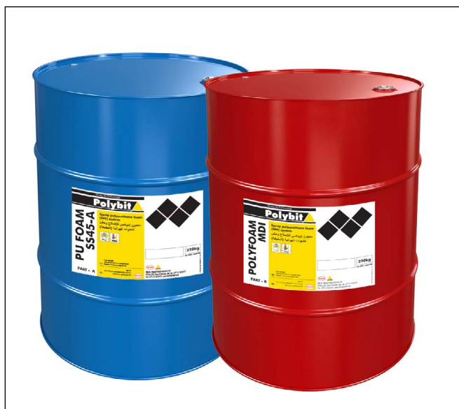
TDS_PU Foam SS45A_GCC_1019

Store at room temperature in sealed drums. Moisture will react with this component to produce a surface skin of polymerized material. Protect from moisture and moisture vapour. Close all drums after use. Maximum permissible storage time is 6 months. The ideal storage temperature is between +20°C and +25°C. MDI may undergo partial crystallization at temperature below 0°C. The product can, however, be brought back into the liquid