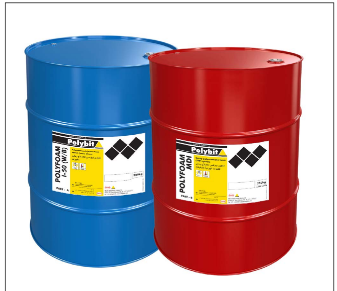
TDS_Polyfoam I-50 (W/B)_GCC_0519 1

Store at room temperature in sealed drums. Moisture will react with this component to produce a surface skin of polymerized material. Protect from moisture and moisture vapour. Close all drums after use. Maximum permissible storage time is 6 months. The ideal storage temperature is between +20°C and +25°C. MDI may undergo partial crystallization at temperature below 0°C. The product can, however, be brought back into the liquid state by placing