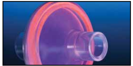
Sealing and bonding of critical medical components