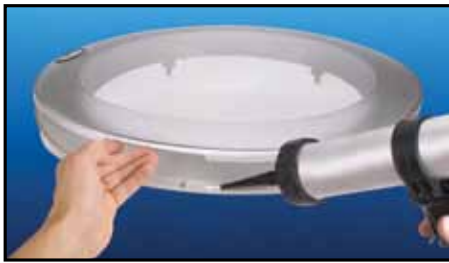
Structural bonding of appliance components