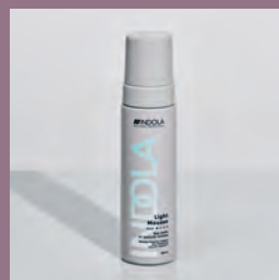
INDOLA Light Mousse

The colour features a deep, cool-toned plum that shifts with the light, a multi-dimensional blend of cherry, mulberry, and violet tones. These rich hues create a mystical depth, reminiscent of ripe forest fruits and shadowy florals found in a secret garden at twilight. The overall effect is both luxurious and mysterious, with a modern, high-gloss finish.