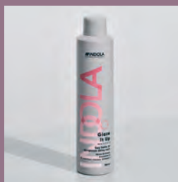
INDOLA Glaze It Up