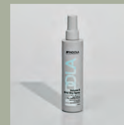
INDOLA Volume & Blow-Dry Spray

The multi-tonal effect creates depth and movement, enhancing the natural wave and catching the light in an organic, earthy way.