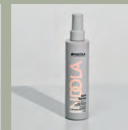
INDOLA Salt Spray