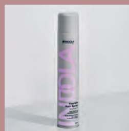
INDOLA Flexible Hairspray