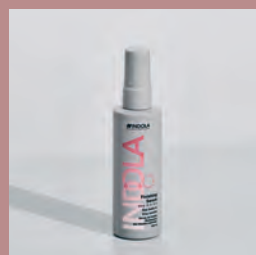
INDOLA Finishing Serum

A luxurious deep crimson red, infused with tonal depth and dimension. The colour shifts between rich wine, ruby, and subtle cherry tones depending on the light, creating a vibrant yet sophisticated result. The shade is reminiscent of the petals of exotic blooms and the warmth of enchanted sunsets. Bold, feminine, and endlessly captivating.