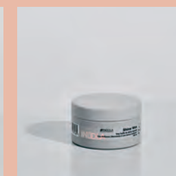
INDOLA Salt Spray INDOLA Shine Wax