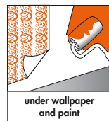
under wallpaper and paint