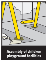
Assembly of children playground facilities