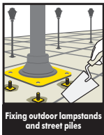
Fixing outdoor lampstands and street piles