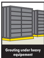
Grouting under heavy industrial equipment