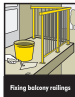
Fixing balcony railings