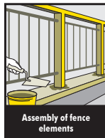
Assembly of fence elements