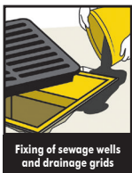
Fixing of sewage wells and drainage grids