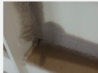
Image 1: Cracks appeared, over time, in the competitor product.