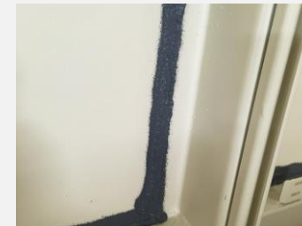
Image 2: Application of Henkel product Teroson WT 218 FR – 200. Even spray pattern, no overspray, non-sag material.