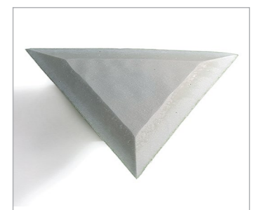
LOCTITE syntactic core machined shape