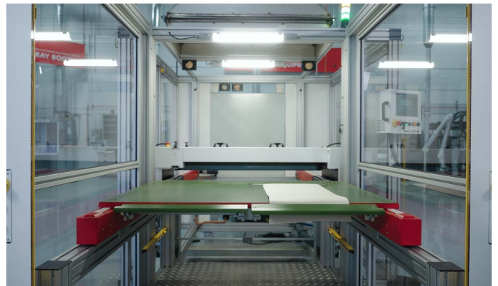
Roll Coater for Hotmelt Technologies