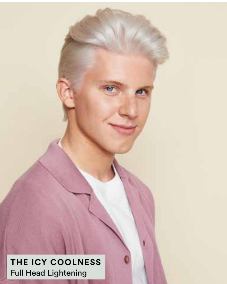
THE ICY COOLNESS Full Head Lightening

Fueled by our revolutionary Hair-Bond Technology, it gives you the power to perfect every blonde technique, so you can meet your clients' unique desires and individual hair needs.