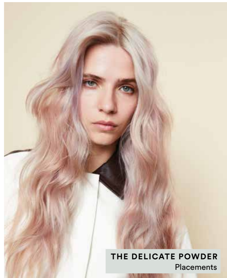
THE DELICATE POWDER Placements