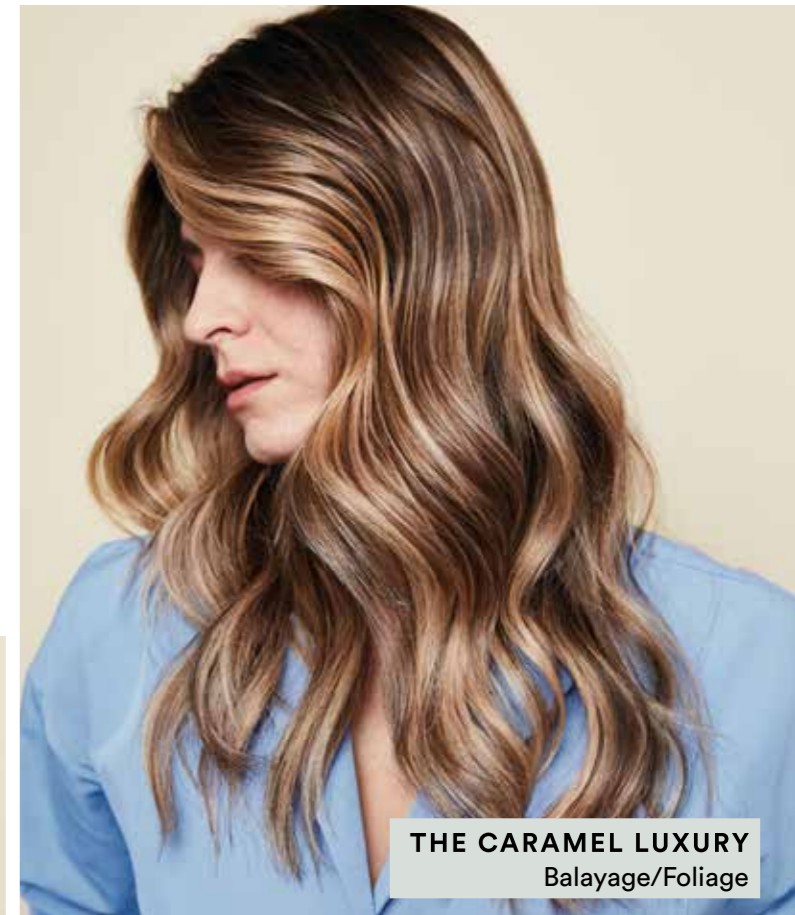
THE CARAMEL LUXURY Balayage/Foliage

Balance salon-perfect blondes with expert at-home maintenance using our BLONDE EXPERT Care range.