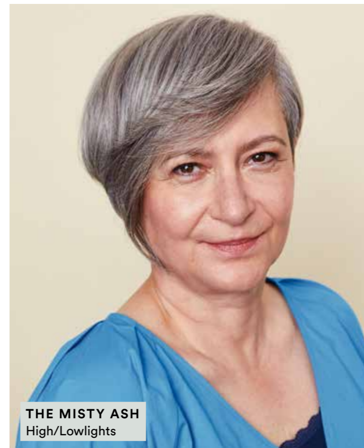
THE MISTY ASH High/Lowlights

A collection of Highlifts and Pastels for creating on-trend looks and expanded service opportunities.