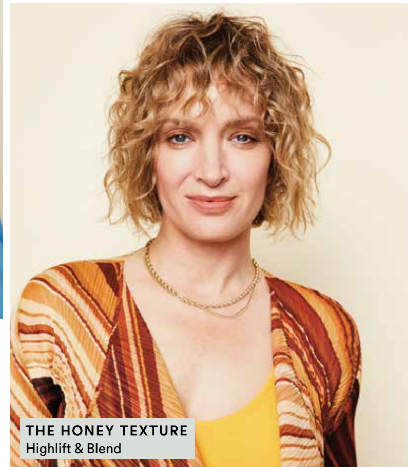
THE HONEY TEXTURE Highlift & Blend