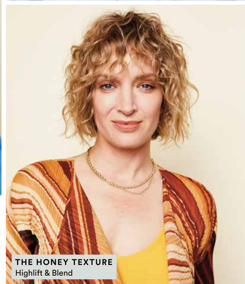
THE HONEY TEXTURE Highlift & Blend