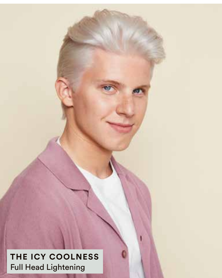
THE ICY COOLNESS Full Head Lightening

Fueled by our revolutionary Hair-Bond Technology, it gives you the power to perfect every blonde technique, so you can meet your clients' unique desires and individual hair needs.