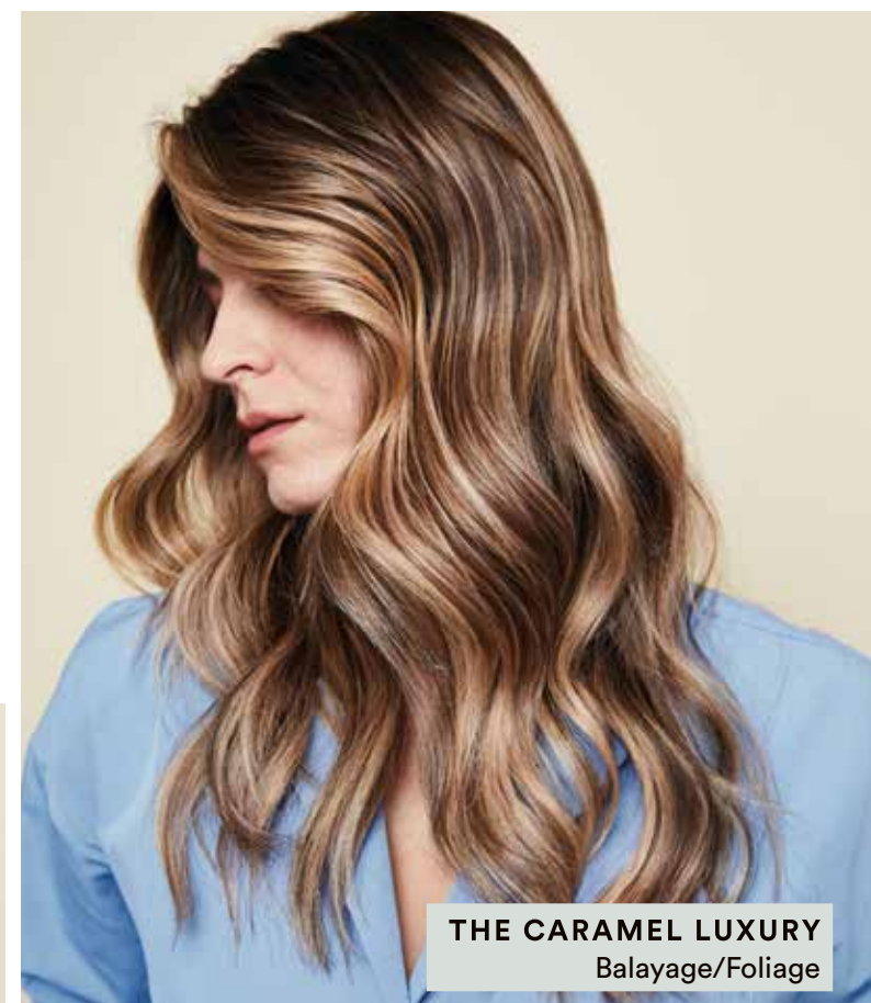
THE CARAMEL LUXURY Balayage/Foliage

Balance salon-perfect blondes with expert at-home maintenance using our BLONDE EXPERT Care range.