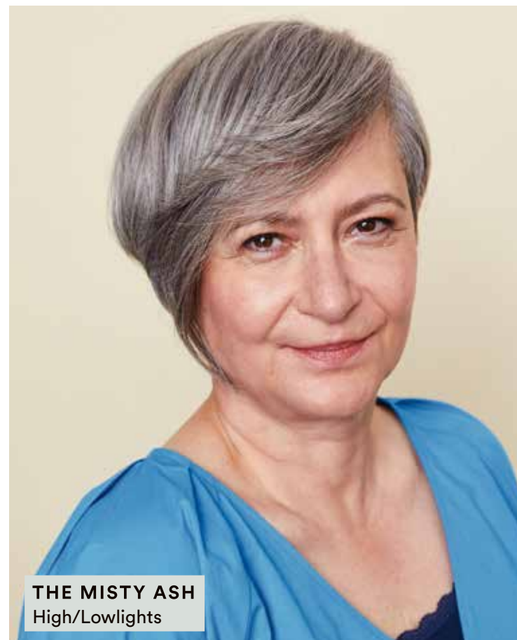
THE MISTY ASH High/Lowlights

A collection of Highlifts and Pastels for creating on-trend looks and expanded service opportunities.