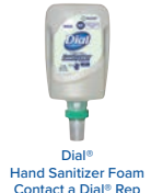
Dial® Hand Sanitizer Foam Contact a Dial® Rep