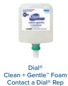
Dial® Clean + Gentle™ Foam Contact a Dial® Rep