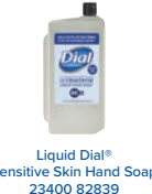
Liquid Dial® Sensitive Skin Hand Soap 23400 82839