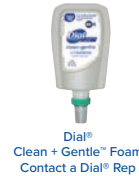
Dial® Clean + Gentle™ Foam Contact a Dial® Rep