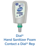
Dial® Hand Sanitizer Foam Contact a Dial® Rep