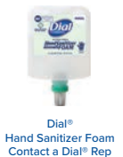
Dial® Hand Sanitizer Foam Contact a Dial® Rep