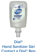
Dial® Hand Sanitizer Gel Contact a Dial® Rep