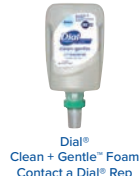
Dial® Clean + Gentle™ Foam Contact a Dial® Rep