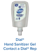
Dial® Hand Sanitizer Gel Contact a Dial® Rep