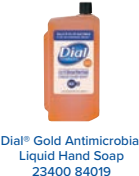
Dial® Gold Antimicrobial Liquid Hand Soap 23400 84019