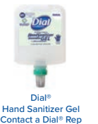
Dial® Hand Sanitizer Gel Contact a Dial® Rep