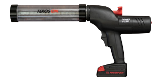
TEROSON® ET BATTERY DISPENSER

All marks are trademarks and/or registered trademarks of Henkel and its affiliates in the U.S., Germany and elsewhere. © 2021 Henkel Corporation. All rights reserved. For more information, visit: https://www.henkel-adhesives.com/collision-repair.html