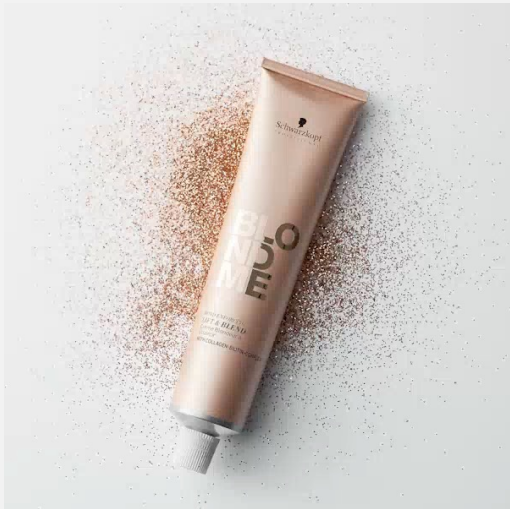
@schwarzkopfpro This is a .MP4

Suggested CTA: Book a colour service! Please link to your salon / local salon finder as required.