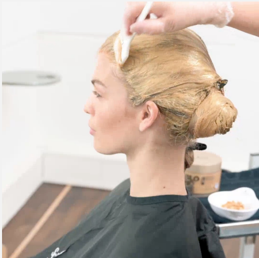
@schwarzkopfpro This is a .MP4

Suggested CTA: Book your treatment! Please link to your salon / local salon finder as required.