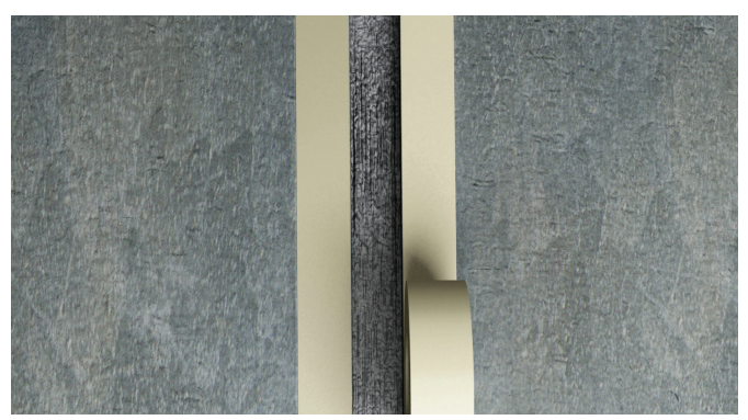
For illustration purpose only

The joint edges must be clean, dry and free from oil, loose particles, cement laitance and other contaminants which may affect the adhesion. A thorough wire brushing,