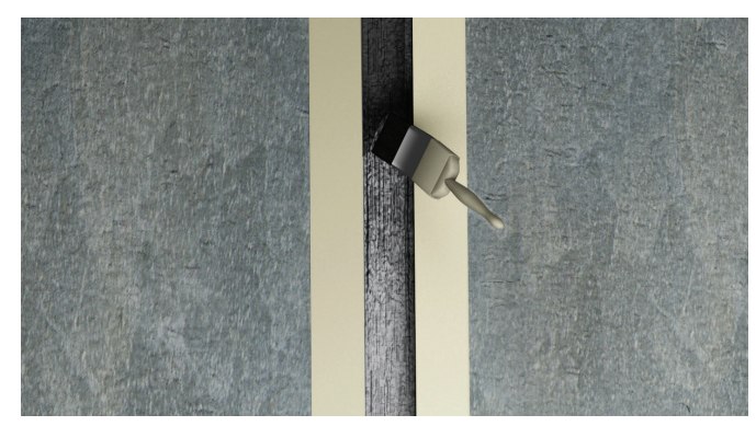
For illustration purpose only

Primer shall be applied to a clean and dry surface prior to the installation of backer rod or bond breaking tape. Polyprime PS* is recommended to be applied on porous substrates. For non-porous substrates such as steel or glass Polyprime NP* is recommended for optimum adhesion. The primer shall be applied by a brush in a thin coat application and shall be allowed to become tack free prior to the application of the sealant. The joint edges shall be