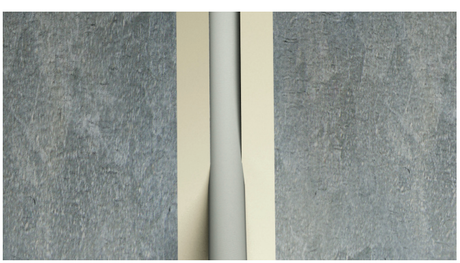
For illustration purpose only

A bond breaking backing rod (Polyrod)* shall be inserted into all movement joints to avoid a three sided adhesion. Use of a backing rod will ensure proper joint depth and at the same time facilitating the formation of an hour glass profile on the applied sealant. The backer rod will also provide resistance to sealant tooling pressure and help to attain proper wetting of the substrate when the sealant is being tooled. The diameter of the backing rod shall be at least 20% larger but not greater than 33% of the joint width. This will ensure that the backer rod remains in compression and in place during sealant installation. For static and joints where the depth is not sufficient for the use