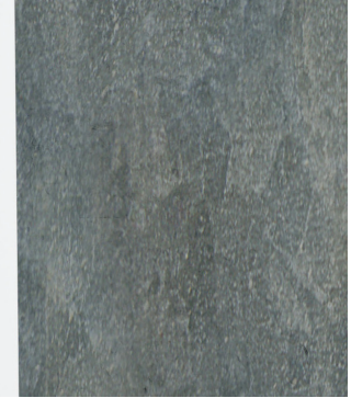
For illustration purpose only