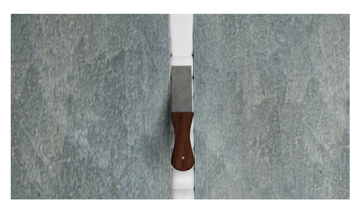
For illustration purpose only