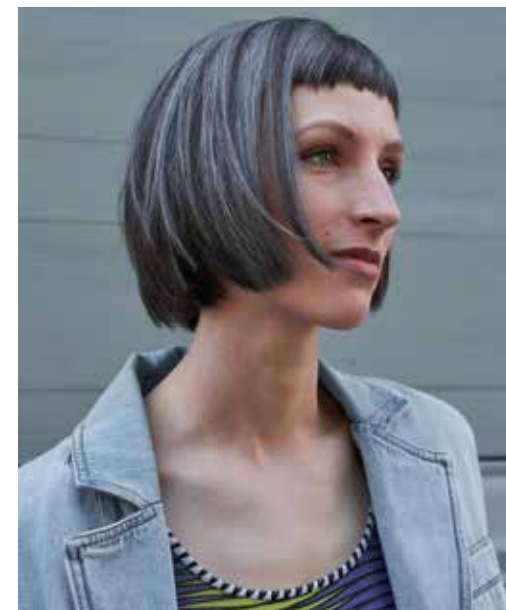
LET'S UNVEIL the confidence within each strand.