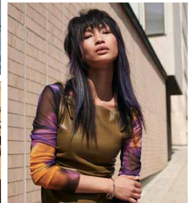
BOLD. Authentic. You.