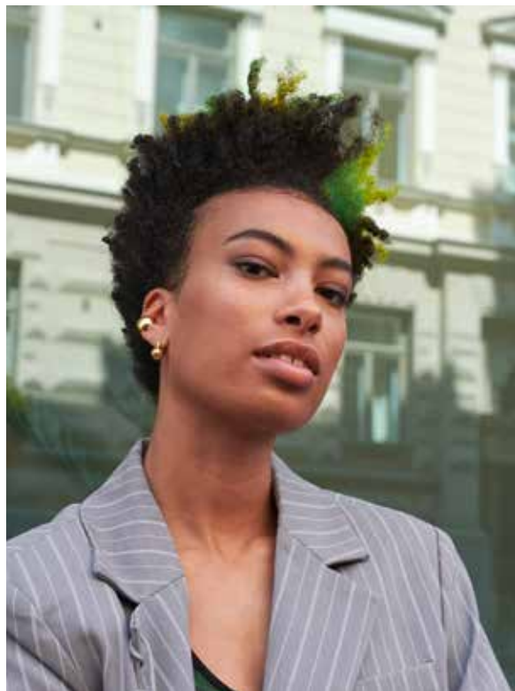
TRUE BEAUTY lies in authenticity.