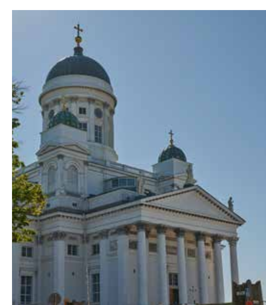
HELSINKI'S HEARTBEAT , echoed in every vibrant, unique style we create.