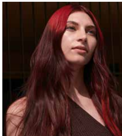
THIS TREND INVITES everyone to embrace freedom of expression and enthusiasm for reinvention.