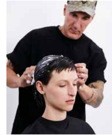
@urbanstudio_kumurov INDOLA Colour Expert, #IndolaSelected member, based in North Macedonia

“ Working with INDOLA is like having an endless box of color crayons. It keeps things simple but makes me think outside the box. Our latest collection? It's like your favorite playlist – familiar but full of surprises. We've crafted looks that anyone can wear, but with a unique twist. It's not just about cutting and coloring; it's about capturing someone's essence. With INDOLA, we're painting dreams on hair, and I'm here for every vibrant moment of it. ”