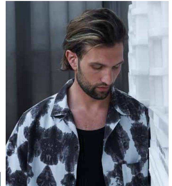
TAKE A MOMENT. Reflect. Find inspiration.