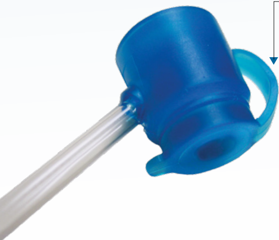
LOCTITE® 3922™ bonds thermoplastic inlet valve assembly.

By using the LOCTITE® 7700 Hand-Held LED Light Source with LOCTITE® 3922™ Medical Device Light Cure Adhesive, US Endoscopy was able to consistently cure the assembly in 10 seconds, while nearly doubling the pull strength. This was possible because the spectral output of the LOCTITE® 7700 LED Light Source is very high-intensity visible light (as opposed to UV light) and the wavelength of the visible light exactly matches that absorbed by LOCTITE® visible light cure adhesives. Other benefits of this light source are that it is inexpensive, small in size, portable, and generates minimal heat and minimal ultraviolet energy, making it safer to work with than traditional UV light sources.