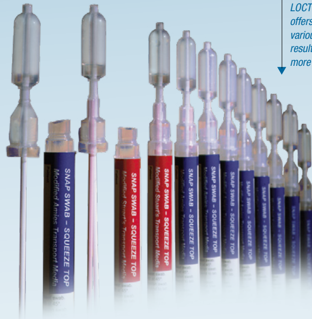
LOCTITE® 3311™ offers adhesion to various swab substrates, resulting in a safer and more reliable device.