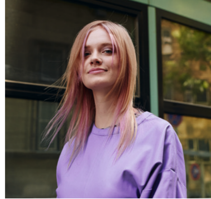
Budapest: Where every shade is celebrated in the sky and architecture