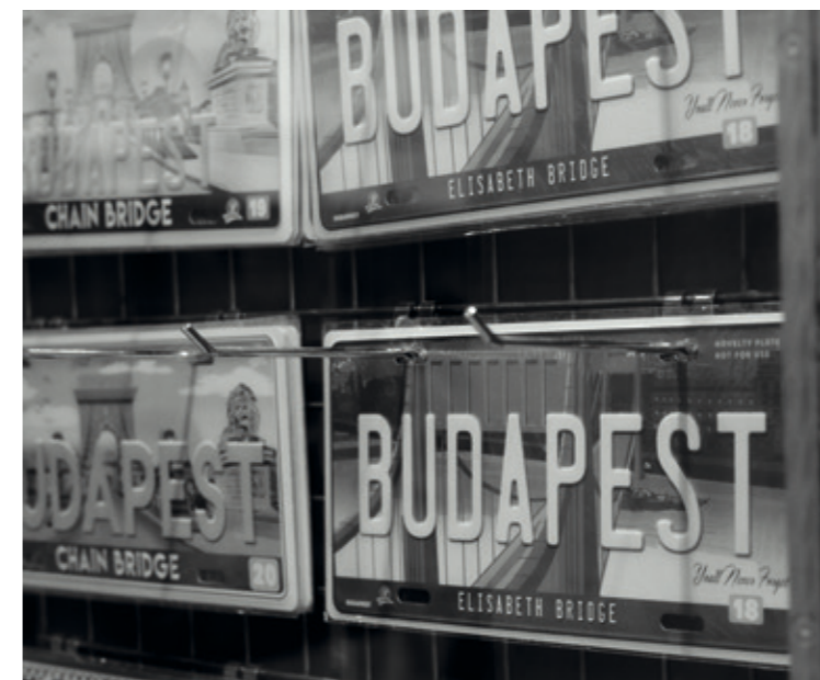
Budapest's walls whisper 'fantasy' and 'escapism' - a city begging for creativity