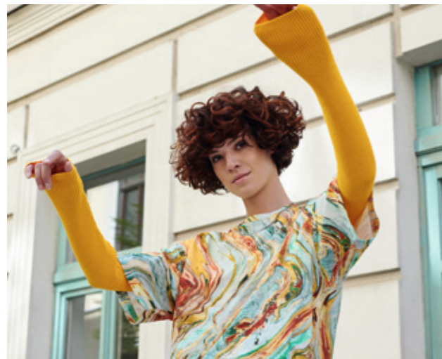
Colours have the power to flood cities and hearts with optimism - Budapest proves it