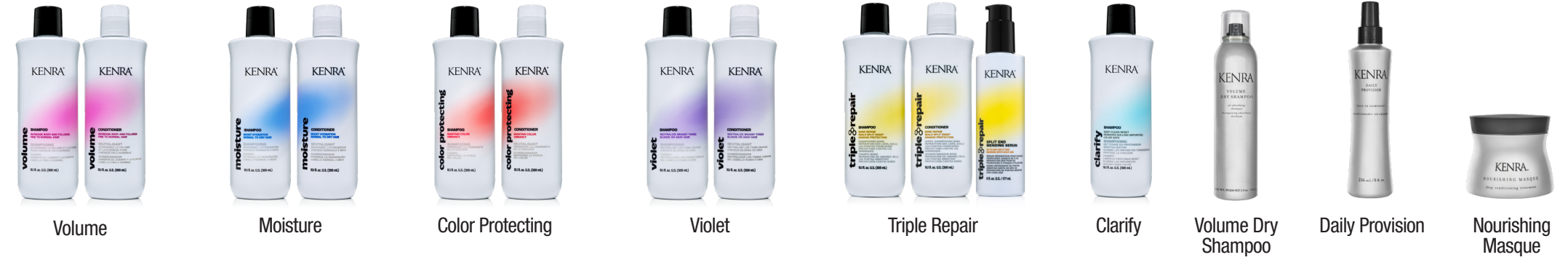
Volume Moisture Color Protecting Violet Triple Repair Clarify Volume Dry Shampoo Daily Provision Nourishing Masque