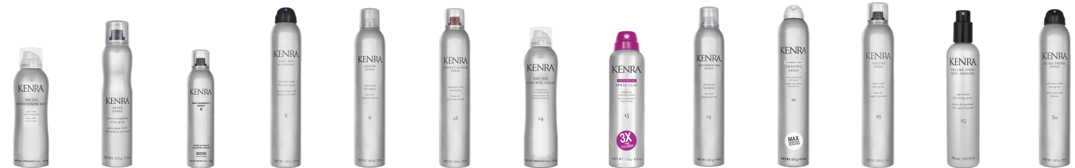
no hold 0 medium-firm hold 13 hold index 25 super hold 30 ultimate hold