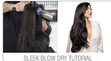
SLEEK BLOW DRY TUTORIAL

VIRTUAL EDUCATION: Free Live Education Classes Updated Monthly Interactive Classes on Theory & Techniques