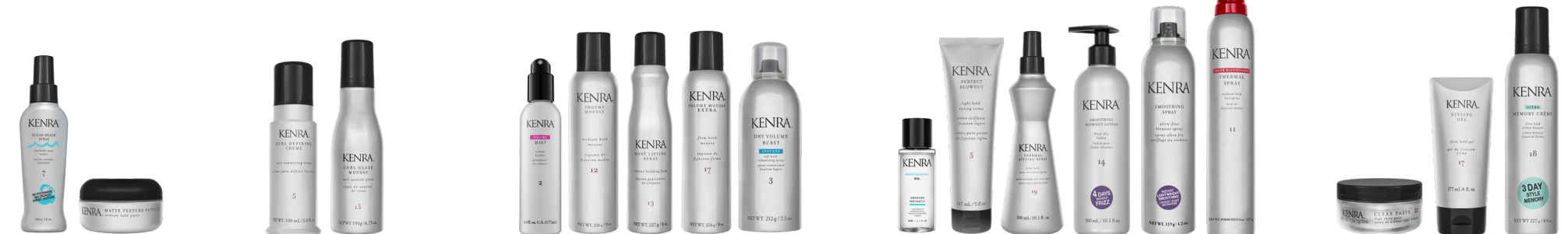
Texture Curl Volume Protect Control