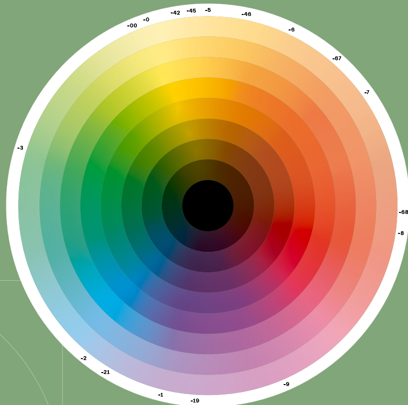
The IGORA ZERO AMM Colour Wheel

All IGORA ZERO AMM formulas are specially designed to be used with IGORA ROYAL Oil Developer or IGORA VIBRANCE Activator Gel/Lotion.