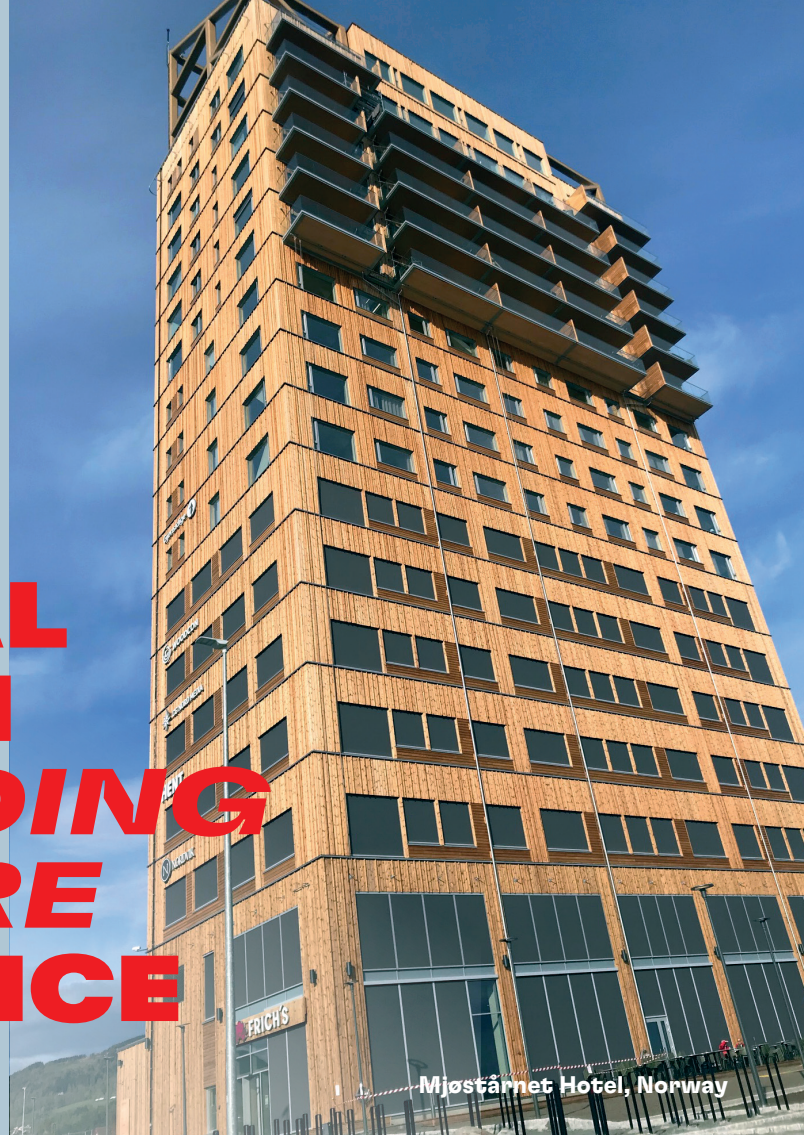
Mjøstårnet Hotel, Norway

LOCTITE HB X enables mass timber producers to deliver building products that meet the most stringent heat and fire safety standards, such as the PRG 320 Standard for Performance-Rated Cross-Laminated Timber.