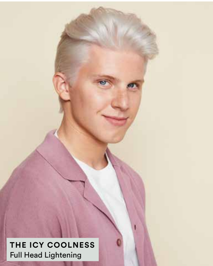
THE ICY COOLNESS Full Head Lightening

Fueled by our revolutionary Hair-Bond Technology, it gives you the power to perfect every blonde technique, so you can meet your clients' unique desires and individual hair needs.