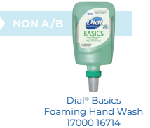
Dial® Basics Foaming Hand Wash 17000 16714