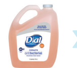
Dial Complete® Foaming Hand Wash 1 gal. 17000 99795