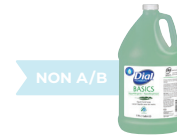
Dial® Basics Hypoallergenic 1 gal. 17000 33809