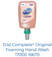
Dial Complete® Original Foaming Hand Wash 17000 16670

Available in Slate (17000 16619) and Ivory (17000 16656)