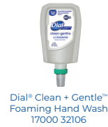
Dial® Clean + Gentle™ Foaming Hand Wash 17000 32106