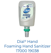
Dial® Hand Foaming Hand Sanitizer 17000 19038