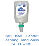
Dial® Clean + Gentle™ Foaming Hand Wash 17000 32100