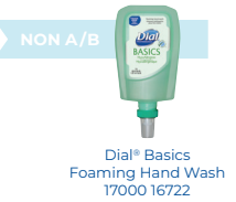
Dial® Basics Foaming Hand Wash 17000 16722