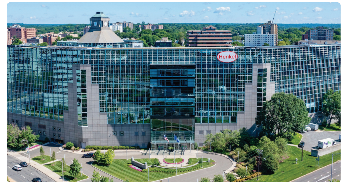
Stamford, Connecticut USA

Henkel is a global company headquartered in Dusseldorf, Germany with a North American regional center in Stamford, Connecticut. Henkel employs more than 50,000 people from 124 nationalities, and 39% of our managers are women. We are committed to leadership in sustainability as we strive to achieve a climate-neutral future and the regeneration of nature. We put our customers and consumers at the center of what we do and are committed to product quality and safety while ensuring business success with integrity.