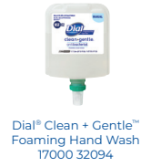
Dial® Clean + Gentle™ Foaming Hand Wash 17000 32094