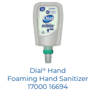
Dial® Hand Foaming Hand Sanitizer 17000 16694