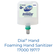
Dial® Hand Foaming Hand Sanitizer 17000 19717