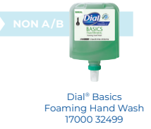
Dial® Basics Foaming Hand Wash 17000 32499