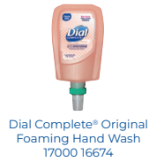
Dial Complete® Original Foaming Hand Wash 17000 16674

Available in Slate (17000 16626) and Ivory (17000 16652)