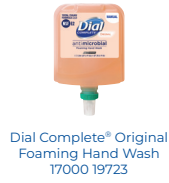
Dial Complete® Original Foaming Hand Wash 17000 19723

Available in Smoke (17000 20075) and Pearl (17000 20078)