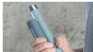
For metal & plastic joints