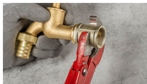
Re-adjust & back off to align fittings