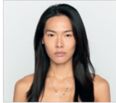
BEFORE // AFTER BEFORE // AFTER

COLOUR TECHNIQUE #colourgrading by @jackhowardcolor