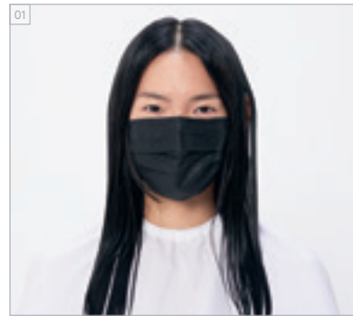
CUT STEP BY STEPS CUT STEP BY STEPS

For more information and get inspired, have a look at the #BackToClassics Trendreport: www.essentiallooks.com/2021-1/trend2