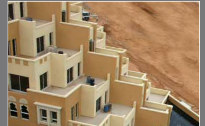
Terrace & Balconies