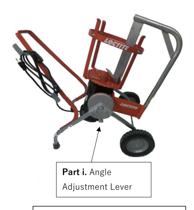
Fig. 1: Loctite® EQ MX Right View