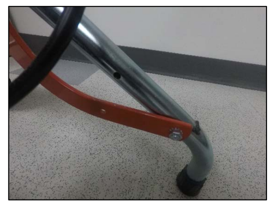
NOTE: The 2-gallon att