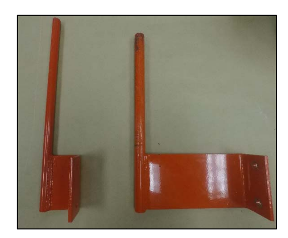
See part b. in Fig. 2 on pg. 11