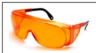
Safety Glasses 98452