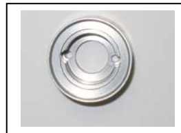
Dosimeter Adapter 1421420