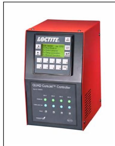
Quad Controller 1180632