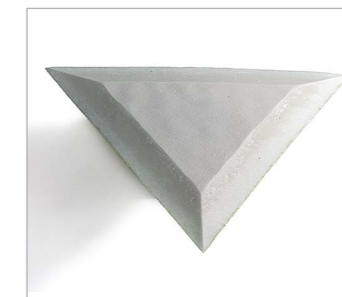
LOCTITE syntactic core machined shape