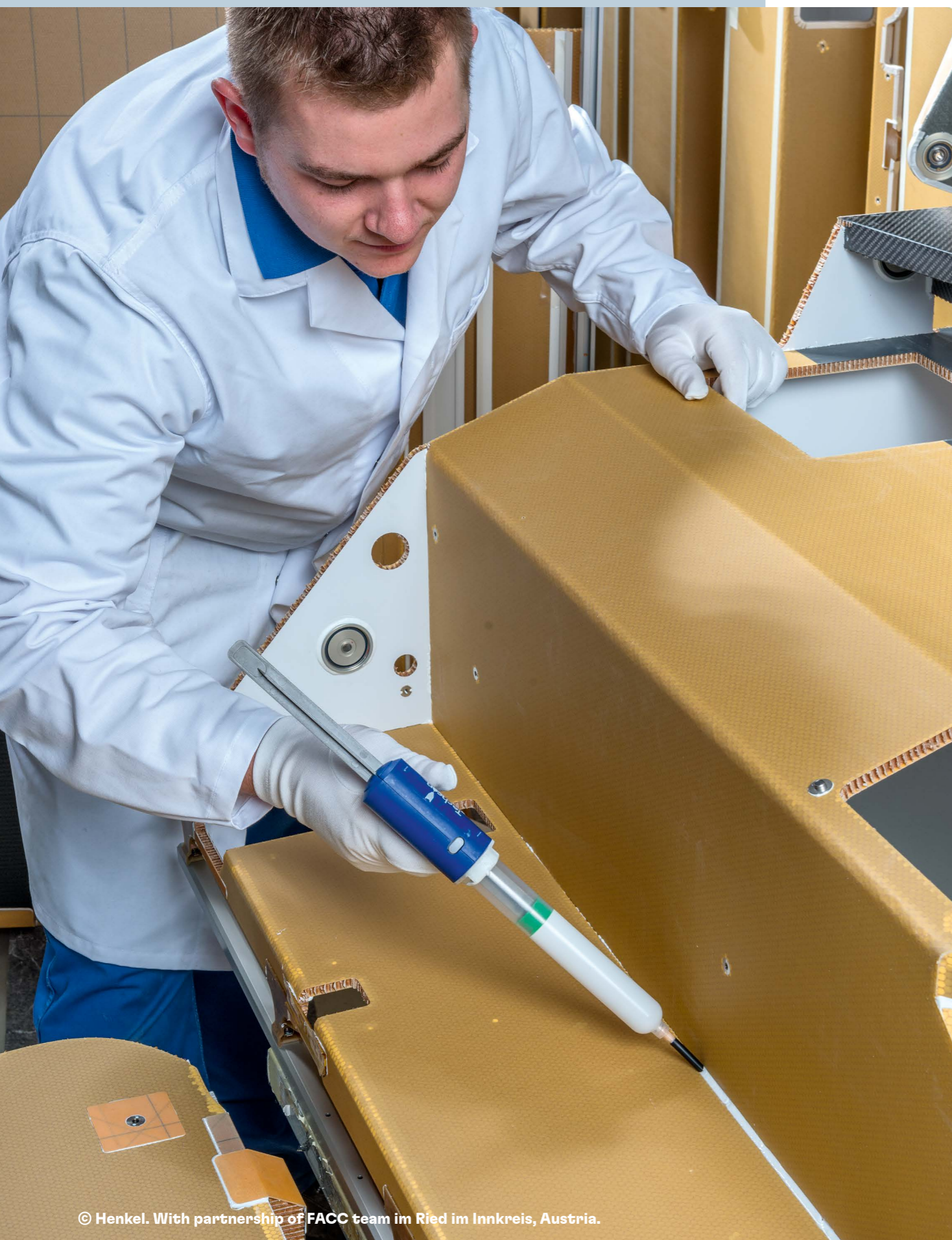
With partnership of FACC team in Ried im Innkreis, Austria.