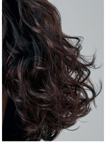
Modern smokey hues that help perfect underlying warmth