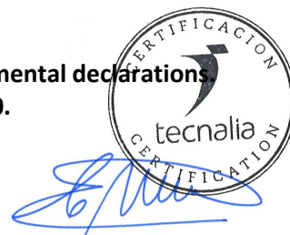
Carlos Nazabal Alsua Manager

Issued date / Fecha de entrada en vigor: 03/07/2024 Update date / Fecha de actualización: 03/07/2024 Valid until / Válido hasta: 02/07/2029 Serial N° / Nº Serie: EPD0971100-E