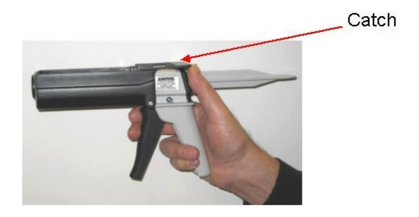
Step 2. Drop in the adhesive package. Return the tray to original position and snap catch back into place.