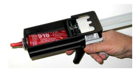
Step 3. Dispense product by squeezing trigger.

Loctite is a trademark of Henkel Corporation, U.S.A. © Copyright 2004. Henkel Corporation All rights reserved. Data in this operation manual is subject to change without notice. Manual P/N: 8901748, Rev A, Date: 11/2008