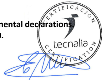
Carlos Nazabal Alsua Manager

Issued date / Fecha de entrada en vigor: 03/07/2024 Update date / Fecha de actualización: 03/07/2024 Valid until / Válido hasta: 02/07/2029 Serial N° / Nº Serie: EPD0970800-E