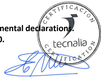
Carlos Nazabal Alsua Manager

Issued date / Fecha de entrada en vigor: 03/07/2024 Update date / Fecha de actualización: 03/07/2024 Valid until / Válido hasta: 02/07/2029 Serial N° / N° Serie: EPD0970500-E