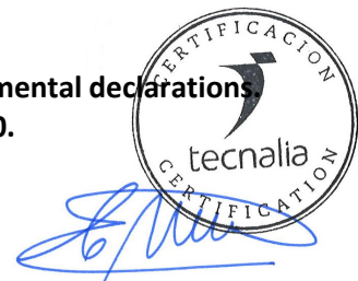
Carlos Nazabal Alsua Manager

Issued date / Fecha de entrada en vigor: 03/07/2024 Update date / Fecha de actualización: 03/07/2024 Valid until / Válido hasta: 02/07/2029 Serial N° / N° Serie: EPD0970400-E