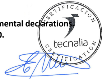
Carlos Nazabal Alsua Manager

Issued date / Fecha de entrada en vigor: 03/07/2024 Update date / Fecha de actualización: 03/07/2024 Valid until / Válido hasta: 02/07/2029 Serial N° / N° Serie: EPD0970300-E