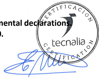
Carlos Nazabal Alsua Manager

Issued date / Fecha de entrada en vigor: 03/07/2024 Update date / Fecha de actualización: 03/07/2024 Valid until / Válido hasta: 02/07/2029 Serial N° / N° Serie: EPD0970200-E