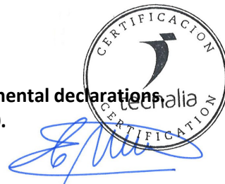
Carlos Nazabal Alsua Manager

Issued date / Fecha de entrada en vigor: 03/07/2024 Update date / Fecha de actualización: 03/07/2024 Valid until / Válido hasta: 02/07/2029 Serial Nº / Nº Serie: EPD0970100-E