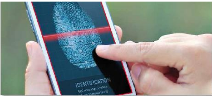
Active Capacitive Measurement

Even though biometric technology has been used for decades for security purposes, it wasn't until the recent introduction of smartphone point of sale payment capability that it became part of the mainstream population culture. "Biometrics" as defined by Merriam-Webster, is the measurement and analysis of unique physical or behavioral characteristics (as fingerprint or voice patterns), especially as a means of verifying personal identity. In short, biometrics offers an exceptionally high degree of security, preventing identity theft and ensuring personal information confidentiality -- the perfect solution for mobile transaction safeguarding.