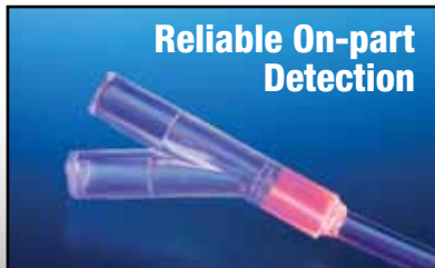
Reliable On-part Detection

Henkel leads the way with its latest innovation in light cure adhesives... Loctite® 3979™ fluoresces red for easy on-part detection either prior to or following cure. This non-sagging gel fills moderate gaps and is ideal for vertical applications or porous surfaces where adhesive migration is not desirable. Loctite® 3979™ cures in seconds with UV or visible light, making it safer and more economical than traditional curing methods.