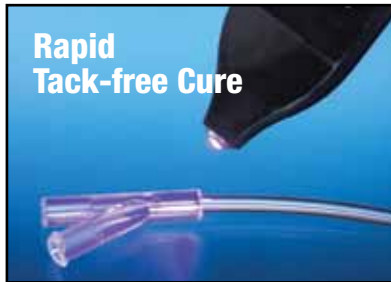
Rapid Tack-free Cure