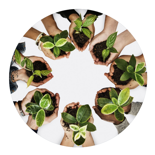
Define what sustainability means in your organization

As you can see, reducing waste at your company is easier with the right plan in place.