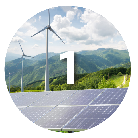
Energy & Climate

Our three focus areas in this endeavor are: