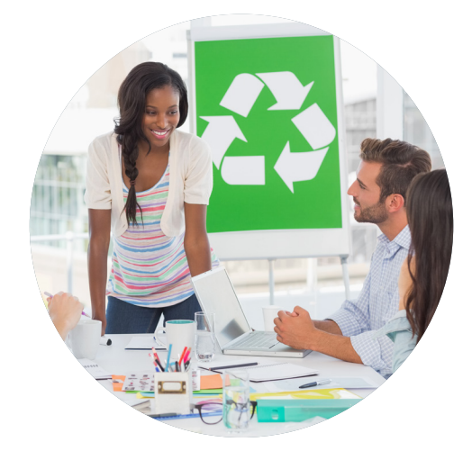
Develop strategies with measureable goals