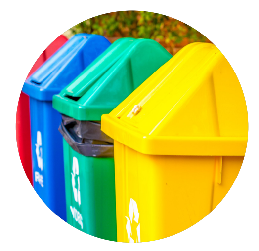
Look for ways to reduce waste or create more efficient processes by reviewing existing programs, composting, universal waste and "unrecyclable" waste.

By following these steps, you should be well on your way to giving a boost to your waste reduction efforts!